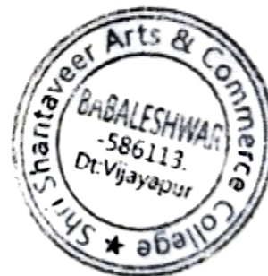
Principal Principal Shri Shantaveer Arts & Commerce College Babaleshwar.